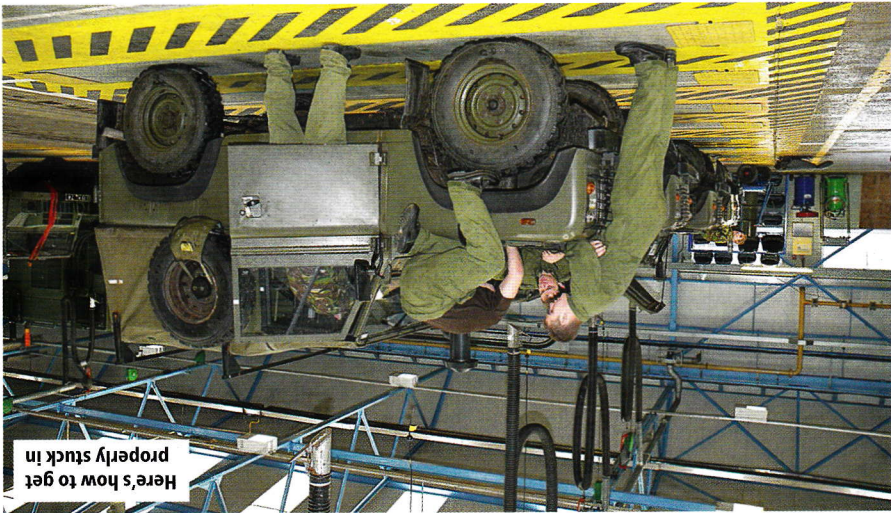
Here's how to get properly stuck in

is because, after each amphibious landing, a Land Rover must have a full maintenance check that's equivalent to a 6000-mile service and there's no sense in subjecting all three vehicles to this. 'If the first vehicle does pack up before the exercise is finished, we'll use the next in line,' says Phil. The Land Rover survives a dozen round trips to the landing craft without a hitch. The falling tide has caught the LCU10, but a gentle shove from the Hippo sends it on its way. We've been on the beach since dawn and the galleys is up to speed, knocking out steaming mugs of tea and a tasty breakfast. But the first priority is to give the Land Rover a bath in the dip tank. As I know from my previous day's training in this tank, the fresh water in here is much colder than the sea. Even so, I envy the two lads nominated to drive through it, because it's an incredible