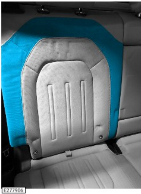
Second row backrest cover.