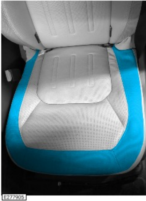
Front cushion cover.