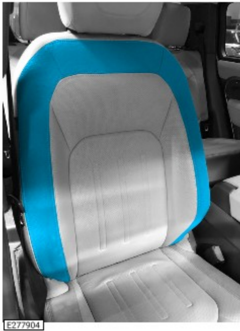
Front backrest cover.